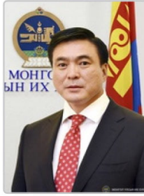
S. AMARSAIKHAN Deputy Prime Minister