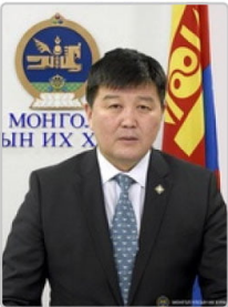
KH. BOLORCHULUUN Minister of Food, Agriculture, and Light Industry