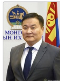
J. SUKHBAATAR Minister, Chairman of the National Committee to Reduce Traffic in Ulaanbaatar