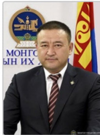
B. CHOIJILSUREN Minister of Energy