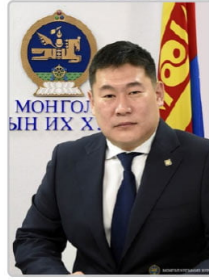
L. OYUN-ERDENE Prime Minister