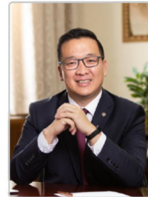
B. BAT-ERDENE Minister of Environment and Tourism