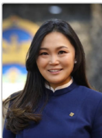
CH. NOMIN Minister of Culture