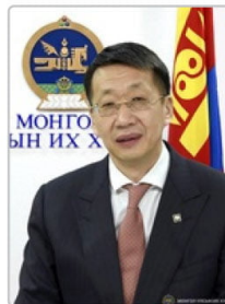
L. ENKH-AMGALAN Minister of Education and Science