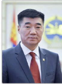
S. BYAMBATSOGT Minister of Road and Transport Development