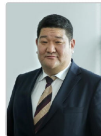
B. MUNKHBAATAR Minister of Construction and Urban Development