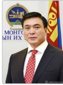
S. AMARSAIKHAN Deputy Prime Minister