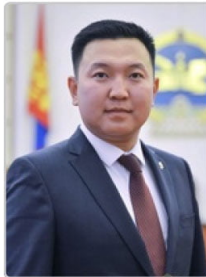
N. UCHRAL Minister of Digital Development and Communications