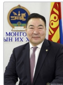
B. BAT-ERDENE Minister of Olympics, Public Physical Education and Sports