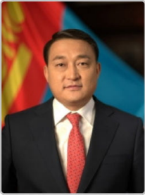
D. AMARBAYASGALAN Chief Cabinet Secretary