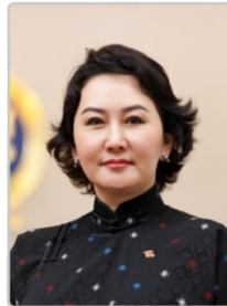
B. BATTSETSEG Minister of Foreign Affairs