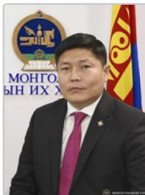
KH. NYAMBAATAR Minister of Justice