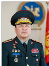
G. SAIKHANBAYAR Minister of Defense