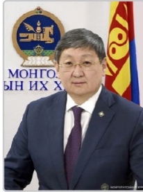
CH. KHURELBAATAR Minister of Economy and Development