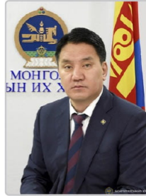
J. GANBAATAR Minister of Mining and Heavy Industry