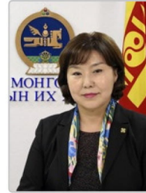
D. SARANGEREL Minister of Labor and Social Protection